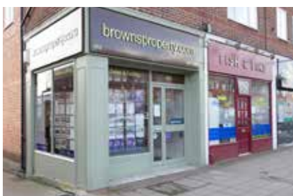
Stoneleigh 42a The Broadway Class A2 Unit To Let