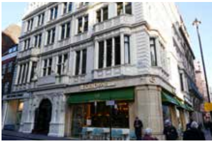
1 Dover Street London W1 Entire property managed