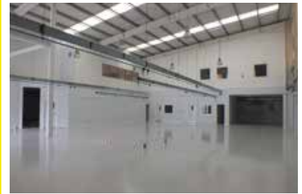
Mitcam Unit 5 Falcon Business Centre 14,500 sq.ft HQ Warehouse Sold