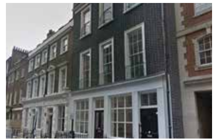
26 Sackville Street London W1 Entire Property Managed