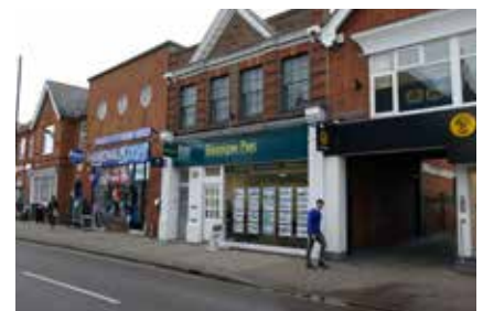
Cobham 1a High Street Designer Offices 1280 sq.ft To Let