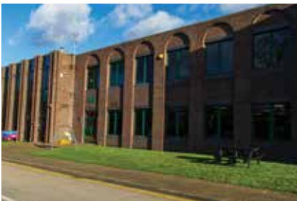
Unit 43 Barwell Chessington 11,633 sq.ft To Let for Aviva