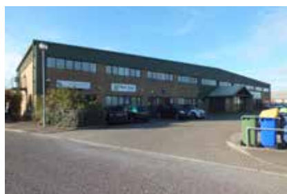
Whitstable Estuary House Managed by