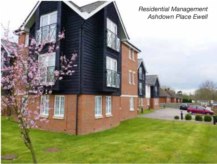
Residential Management Ashdown Place Ewell