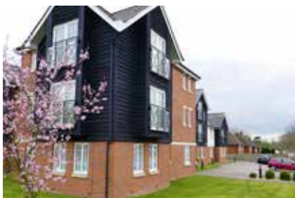
Ewell Ashdown Place 18 Flats Managed