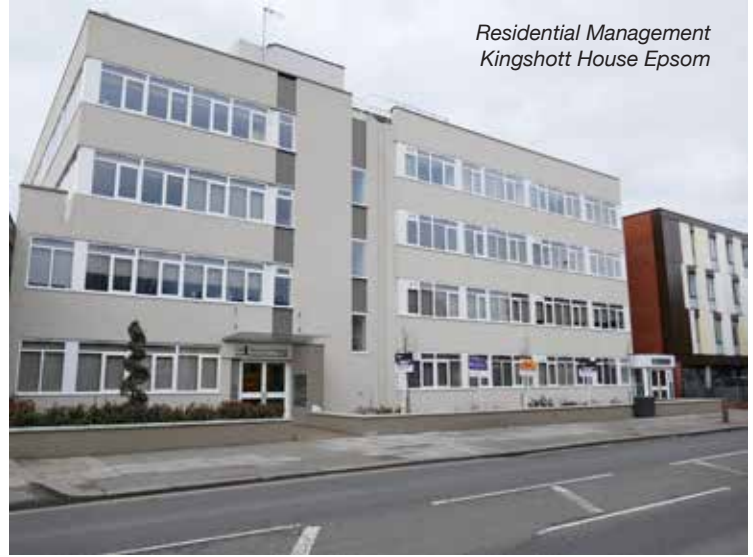
Residential Management Kingshott House Epsom