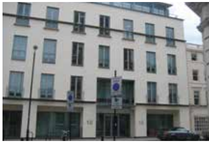
20 Lower Grosvenor Place SW1 Property Managed